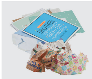
Greetings cards & wrapping paper