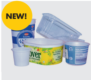
Plastic pots, tubs & trays