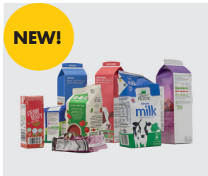
Food & drink cartons