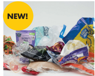
Soft plastics & film (e.g. plastic wrapping, carrier bags, film lids)