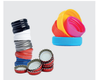
Plastic & metal lids & tops