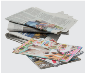
Newspapers & magazines