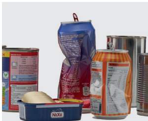
Tins & cans