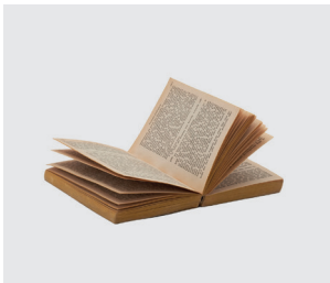
Paperback books (or donate to charity)