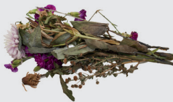
Flowers, leaves & weeds