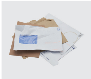
Envelopes & junk mail