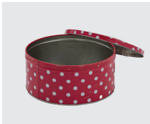
Metal & plastic sweet & biscuit tins