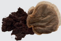
Tea bags & coffee grounds