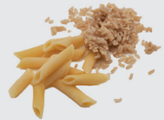
Rice & pasta