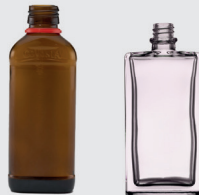
Medicine & perfume bottles

Lids and tops can be left on your glass bottles and jars