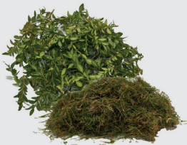
Grass & hedge cuttings