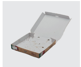
Clean pizza boxes