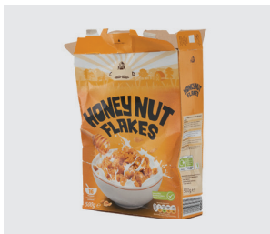
Cereal boxes & food sleeves