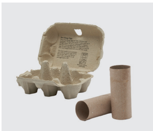
Egg boxes & toilet roll tubes