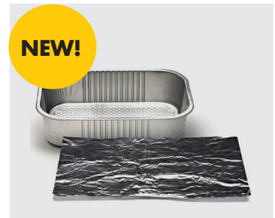
Clean aluminium foil & foil trays