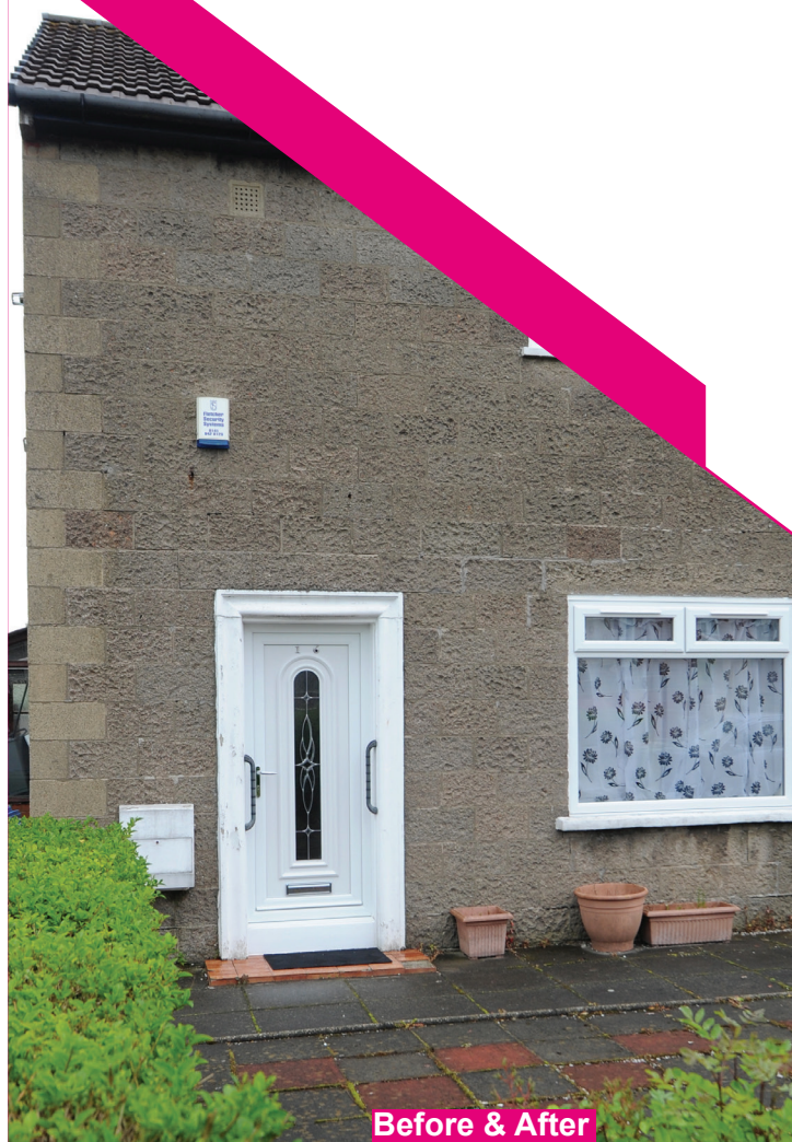
Before & After External Wall Insulation, Milton

Since the HEEPS programme began in 2013, Glasgow has attracted over £19m of ECO funding.