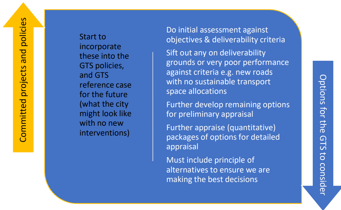
Figure 2 Committed projects & policies v. options for the GTS to consider

The following presents a summary of the long list of options now being considered in the GTS process: