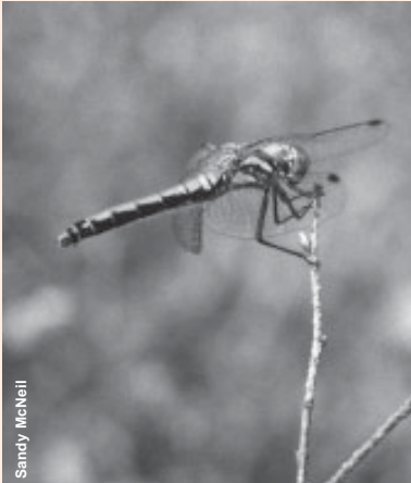
Black Darter ( Sympetrum danae )