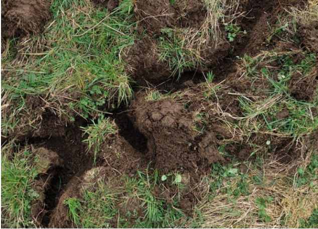
Fig 6: Grassland water vole burrow system dug out by hand

Biosecurity best practice is encouraged e.g. equipment (gloves, traps, etc) cleaned between sites to minimise cross contamination. Disposable items like handling tubes should be thrown away.