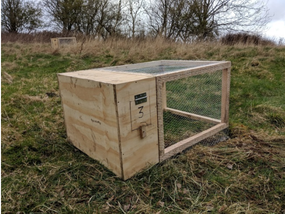
Fig 8: Water vole release built out of plywood and chicken wire. Recommended size 45cm x 45cm x 25cm

this varies considerably between individuals and can range from 20 minutes to over 7 days. It may be necessary to bring the release pens in overnight because of the risk of predation or vandalism. Encouraging water voles to dig out of the release pen by hand digging a starter burrow can be beneficial. Release pens should be checked daily and re-provisioned with food if necessary.