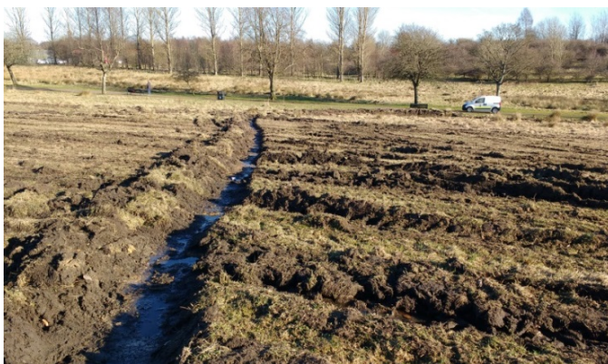
Fig 9: The suitability of grassland habitat can be enhanced for water voles by creating swales to improve drainage

The area of habitat creation required is based on the number of animals to be accommodated. Habitat corridors must be a minimum width of 10m and of similar quality.