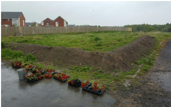
Fig 11: Bunds can be created using a mixture of topsoil and subsoil to increase the area of habitat available for grassland water voles. Turves can then be directly transplanted on the bund or it can be seeded with the recommended water vole plant species mix.