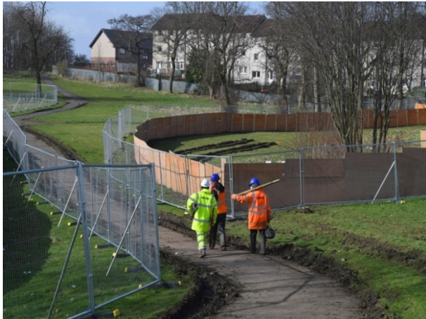
Fig 3: Site management using both Heras and water vole fencing. During the trapping phase sites should be well managed with clear demarcation between working areas and water vole habitat to minimise trampling and disturbance.