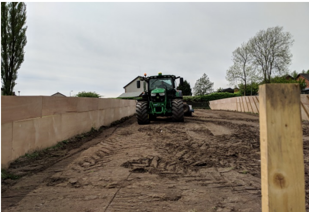
Fig 7: Once a site has been designated free of water voles after 5 full clear days of trapping, the area should be made uninhabitable by stripping the turf and compacting the soil with a roller.