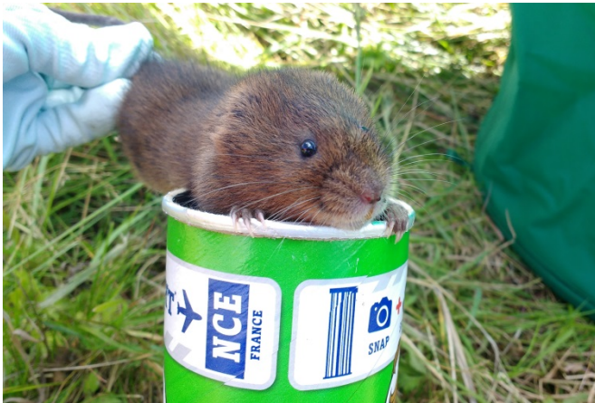
Fig 2: Juvenile grassland water vole caught as part of a radio-tracking study in Glasgow. Coat colour varies across grassland populations with a mixture of black and brown individuals.