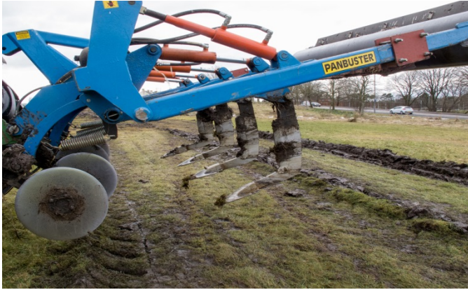
Fig 10: Sites with compacted soil can be made suitable for grassland water voles by using equipment such as the Panbuster. The blades slice through the compacted soil layer breaking it up but cause minimal damage to the turf on the surface. This reduces the time required for habitat creation.