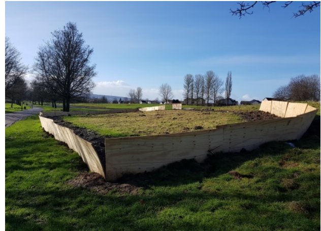
Fig 4: Water vole fencing installed at a depth of 100cm below ground and 50cm above.