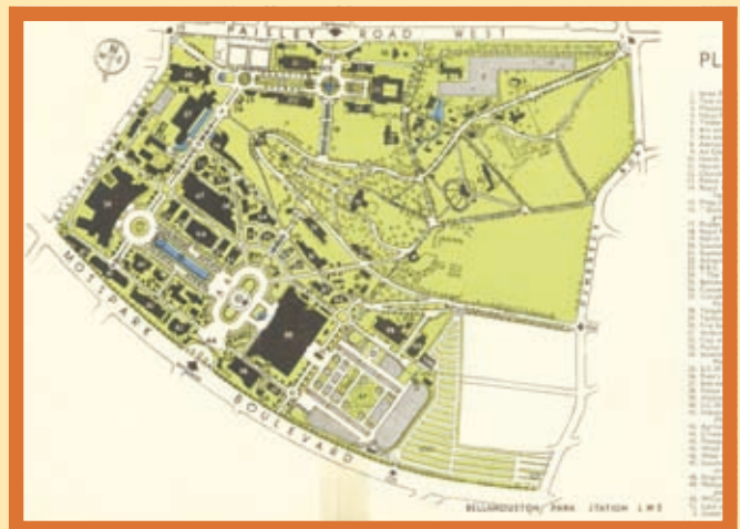
Plan of 1938 Empire Exhibition

Bellahouston Park, due to its size and relative absence of formal walkways has always been an ideal location for the city's events. The largest event to take place in Bellahouston was the ambitious 1938 Empire Exhibition. The site took fourteen months to build and was attended by 12.5 million visitors.