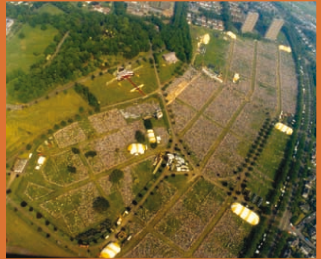
View of crowd from air at Papal visit

Around 300,000 people from all over Scotland gathered on a spectacular warm summer's day to celebrate mass. At the end of the mass the congregation, the biggest crowd ever assembled in Scotland to date sang " Will Ye No Come Back Again? " After his address the Pope was applauded for eight minutes.