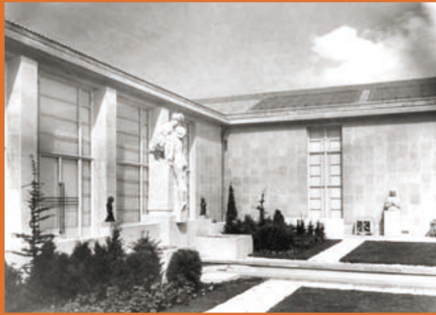
Sculpture Courtyard in Palace of Art 1938

In 1965 the Royal Air Force held a display at the west side of the park where the leisure centre is now located. The display consisted of six aircraft; Valiant B1 – cockpit section, Hunter F4, Javelin – cockpit section, Chipmunk T10, Gnat T1 Trainer and a Javelin F(AW). In the background the tenements on Paisley Road West and Bellahouston Drive have hardly changed.