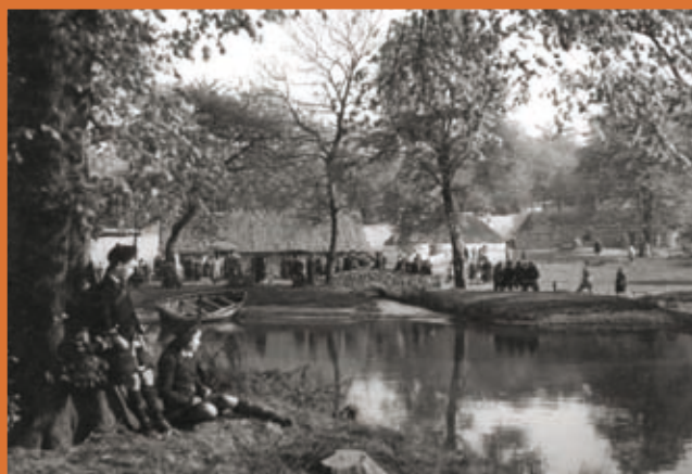
Highland Village by Colin Sinclair

Dominating the whole exhibition on the summit of Bellahouston Park, above the grand staircase complete with waterfall, stood 'The Tower of Empire' affectionately known as 'Tait's Tower'. Designed by Thomas Tait, the