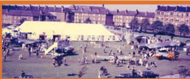
Royal Air Force display

In 1965 the Royal Air Force held a display at the west side of the park where the leisure centre is now located. The display consisted of six aircraft; Valiant B1 – cockpit section, Hunter F4, Javelin – cockpit section, Chipmunk T10, Gnat T1 Trainer and a Javelin F(AW). In the background the tenements on Paisley Road West and Bellahouston Drive have hardly changed.