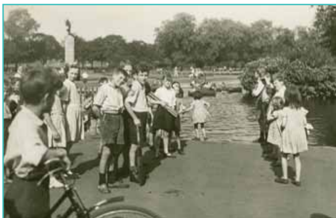
Victoria Park Circa 1955