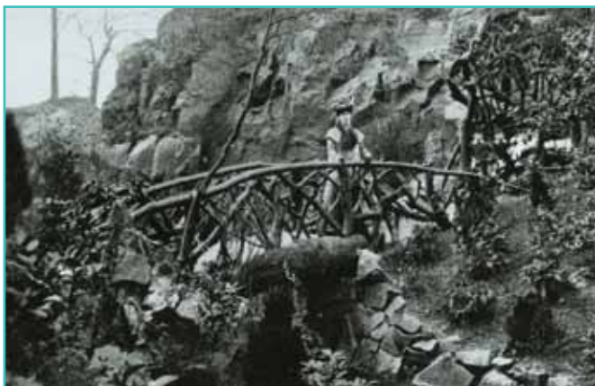
Lady in Rock Gardens