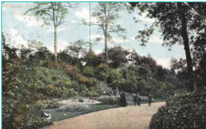
View of flagpole from Fossil Grove

There once stood a handsome flagpole in this location of the park, 90 feet high, topped with a copper crown, with pavilion and bandstand at the base in octagonal shape with canopied roof supported by eight columns, 22 feet in diameter, erected at the highest point of the park. The flag pole featured a bronze plaque bearing the inscription "Presented by John Ferguson Esquire, Ex Provost, Convener of Parks Committee, June 1887, ".The late ex-Provost Ferguson, who deserves much credit for the purchase and for the laying-out of the park, unfortunately did not live to see the result of his labours, he sadly died shortly before the park was opened. From the flagstaff's former location you would have been able to take in the fine unspoilt long distance views of the surrounding scenery. To the north and west lie the hills of Kilpatrick, Campsie and Strathblane while from the front are the wooded slopes of Jordanhill. Away to the south west are the Gleniffer Braes and Neilston