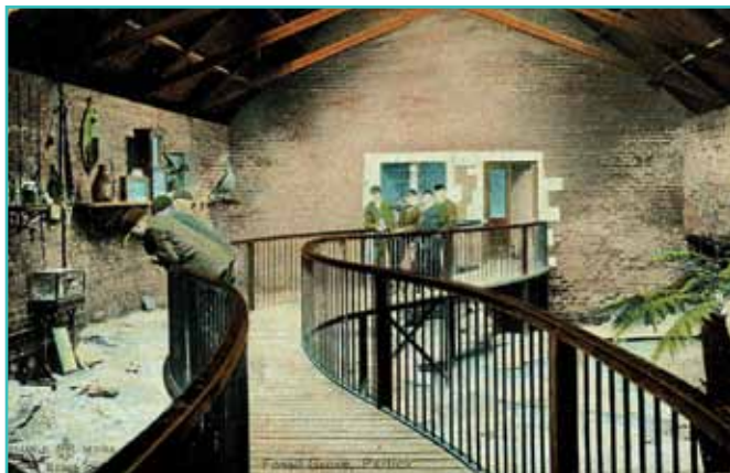
Fossil Grove 1905