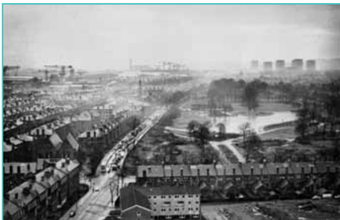
Victoria Park Circa 1967