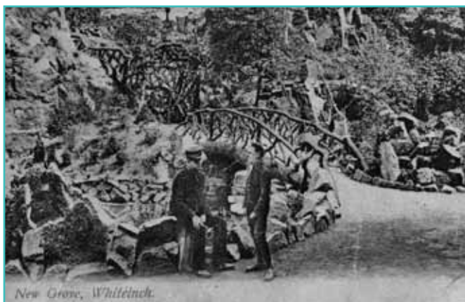
Victoria Park Fossil Grove Circa 1905