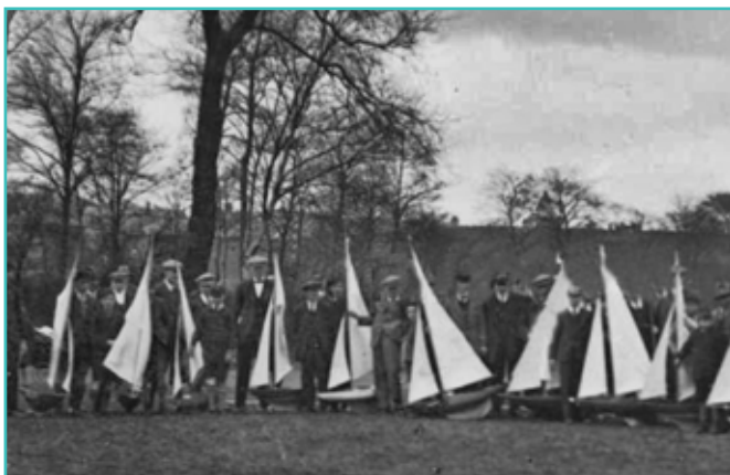
1911 Model boats