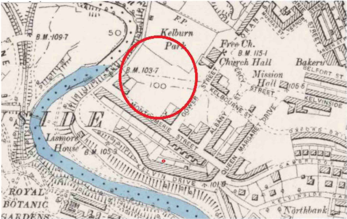
Map 2: 2 nd edition OS plan (Dunbartonshire sheet XXV N.E. & XXVI N.W., published 1899 showing the approximate location of the site circled in red (from http://maps.nls.uk/ )