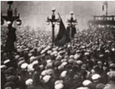
George Square, Bloody Friday, 1919

George Square, George Street, Glasgow, G2 1DU