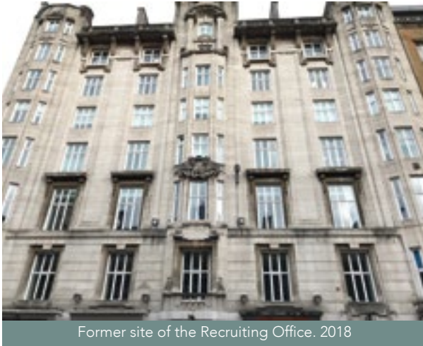
Former site of the Recruiting Office. 2018

In August 1915 the Northern Assurance company donated the use of their premises at 84 St Vincent Street to the 5th Battalion Cameronians (Scottish Rifles) for use as a recruiting office. Such offices had sprung up across the city but interestingly this battalion sought to encourage potential