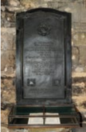
Glasgow Cathedral Highland Light Infantry Memorial. 2013

Cathedral Square, Castle St, Glasgow, G4 0QZ