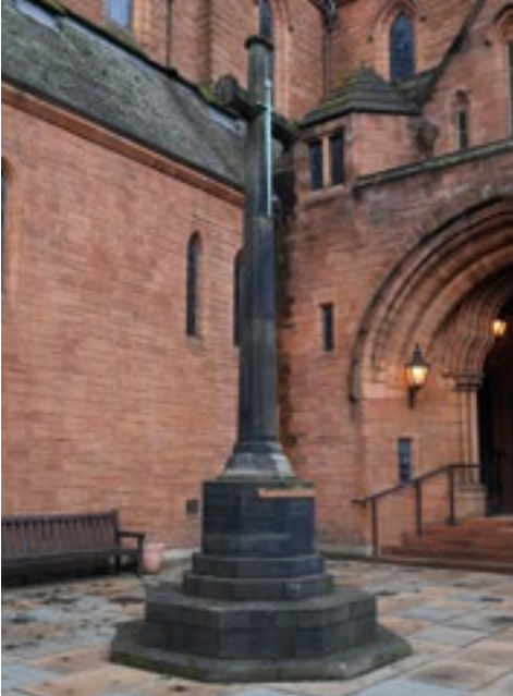
Barony Hall Cross of Sacrifice. 2018

This sandstone Cross of Sacrifice exists behind railings outside the south east corner of JJ Burnet's church. Religious symbols were often used as a way to provide comfort to the bereaved through attributing a greater meaning to the loss. The bronze sword attached to the face of the monument points downwards, reflecting the form of the cross whilst representing the conflict as that of a religious crusade. It was designed by the well known architect Peter MacGregor Chalmers who produced several other war memorials such as those in Crieff and Ardrossan.