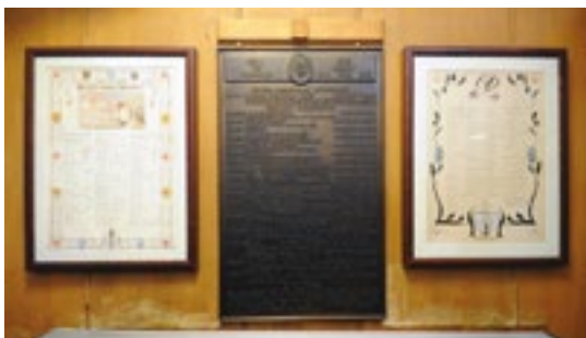
Royal Infirmary Memorial. 2013

Glasgow Royal Infirmary, Centre Block. 84 Castle Street, Glasgow G4 0SF