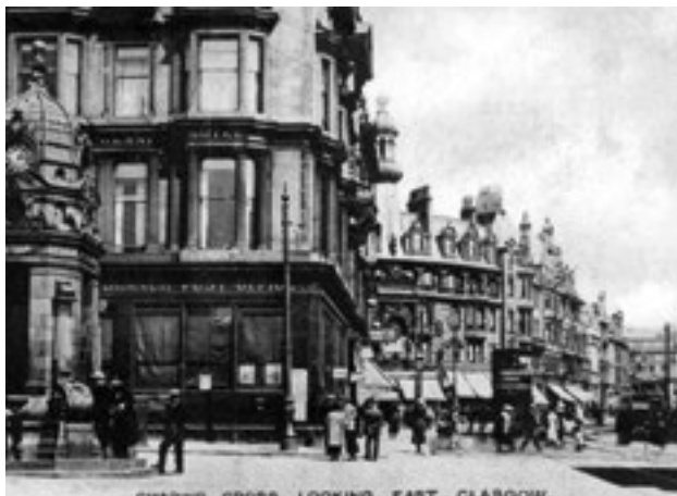
CHARING CROSS, LOOKING EAST, GLASGOW. Grand Hotel at Charing Cross circa 1910

Opposite 8 St. Georges Road, Glasgow, G3 6UJ