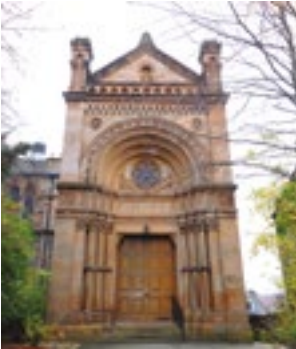
Garnethill Synagogue. 2013

This synagogue contains an ornate marble tablet listing the 97 names of the congregation who served during the First World War including 17 who died. In total around 1200 Jewish Glaswegians enlisted with 86 losing their lives. At the memorial's unveiling on the 12 December, 1920 the Lord Provost noted that "no section of the community had taken up arms more willingly than the Jews in Glasgow". Some of the names on the tablet can also be found on stones at the Garnethill Hebrew Burial Ground (see North Glasgow trail).