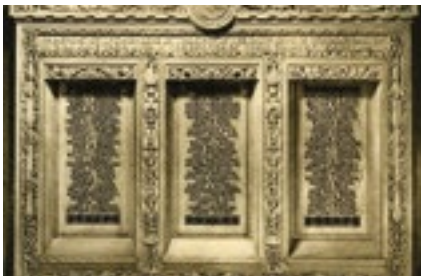
Bank Of Scotland War Memorial . 2013