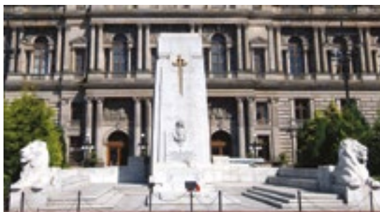
City Chambers (with cenotaph in foreground). 2013

Accompanying the Cenotaph is a Lamp of Remembrance and the WW1 Roll of Honour located within the entrance hall of Glasgow's council headquarters, the City Chambers. This documents the name, rank, regiment and address of the 17,695 of men from the city who failed to