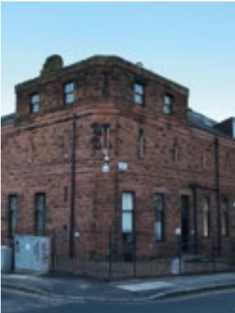
Haldane Building, Rose Street. 2018

Haldane Building, Rose Street, Glasgow, G3 6RN