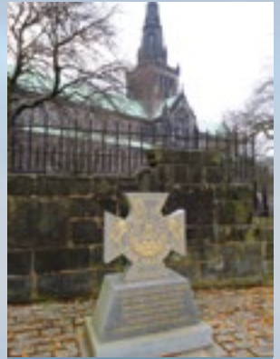
Kirk Lane Victoria Cross Memorial. 2013