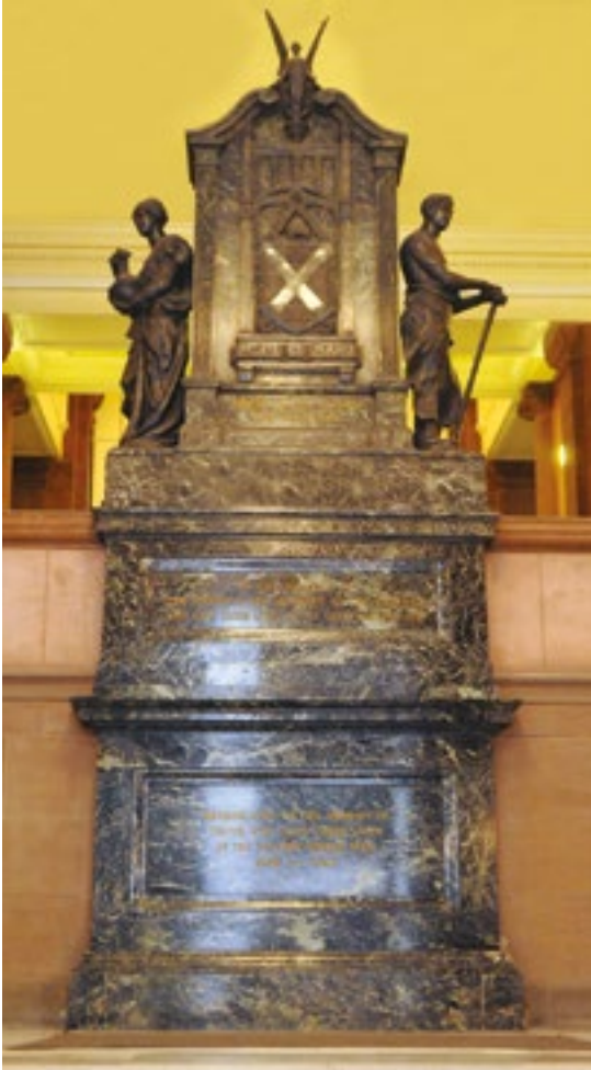
Royal Technical College Memorial

University of Strathclyde, Royal College. 204 George Street, Glasgow, G1 1XW