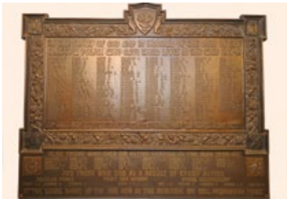
Glasgow Police Museum Memorial. 2013

1st Flr, 30 Bell Street, Merchant City, Glasgow, G1 1LG