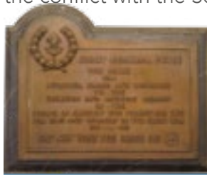
Scout Memorial House. 2013

This building on Elmbank Street was acquired, named and dedicated to the Scouts of Glasgow who served during the First World War. A large number of former Scouts and Leaders from the city took part in the conflict with the Scout Roll of Honour (available online through the Scout Association Archive) listing those who gave their lives. The house now contains the Glasgow Scout Shop and inside the entrance is a commemorative bronze plaque.