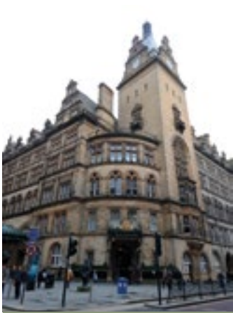
Glasgow Central Hotel. 2013